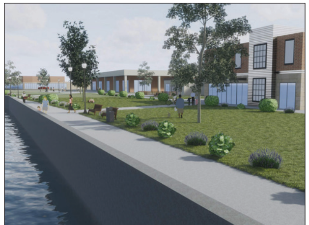
Physical development concept leveraging natural resources.

Support municipal and corporate initiatives that improve mobility, connectivity, and access for all, creating a compelling place to live.